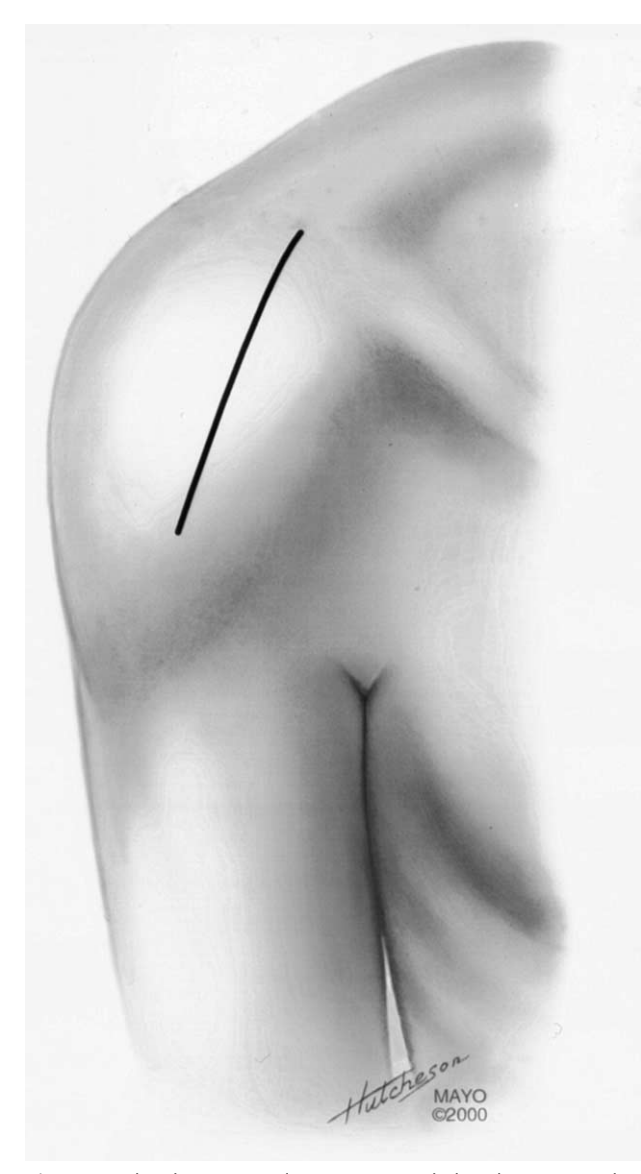
Figure 1 The skin incision lies 1.5 cm medial to the acromioclavicular joint extending distally, lateral to the coracoid, ending 2 to 3 cm proximal to the anterior aspect of the deltoid insertion.

attachment of the coracoacromial ligament. Three mediumsized Kocher clamps are placed on the edge of the incised deltoid origin. These are then allowed to fall laterally and posteriorly, keeping the anterior deltoid lateral to the operative field. This is further aided after mobilization of the subacromial-subdeltoid bursa by placing a Richardson retractor lateral to the humeral head. Repair of the origin of the deltoid varies depending on the attachment site. No. 2 absorbable or nonabsorbable suture is placed through the bone of the acromion through use of either a trochar needle or burr holes. The suture is passed through approximately two thirds of a centimeter of the detached muscle. Simple sutures are used. Sutures progressing from lateral to medial are then placed through the bone of the acromioclavicular